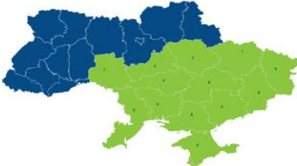
Fig. 2. Map of the Orobanche cumana distribution in Ukraine.

In our country, the most dangerous areas, according to the spread of the parasite and its racial composition, are Donetsk, Luhansk and Zaporizhzhia regions. Nearly 50 % of the areas in these areas have a high risk of spreading new races. It is about 190 thousand hectares in Donetsk, 150 thousand hectares in Lugansk and 120 thousand hectares in Zaporizhzhia region. Also, the potential distribution risk persists in Odesa, Dnipro and Kropyvnytsyi regions (Fig. 2).