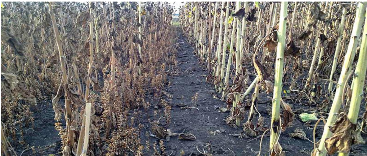
Fig. 4. Sunflower seeds which are affected by Orobanche cumana in comparison with resistant sunflower

In addition to the accumulation of lignin in resistant sunflower genotypes, deficiency of germinator growth germs can be observed. Several mechanisms of resistance to Orobanche were also described: insufficient amount of germination stimulants allocated to the root of the host plant; mechanical or chemical barriers (lignification or hypersensitivity reaction) accumulation of toxic components that slow down the growth of tubers and their association with the host's vascular system (Antonova et al., 2013; Marinkovic et al., 2013; Guchetl et al., 2014; Markin et al., 2016).