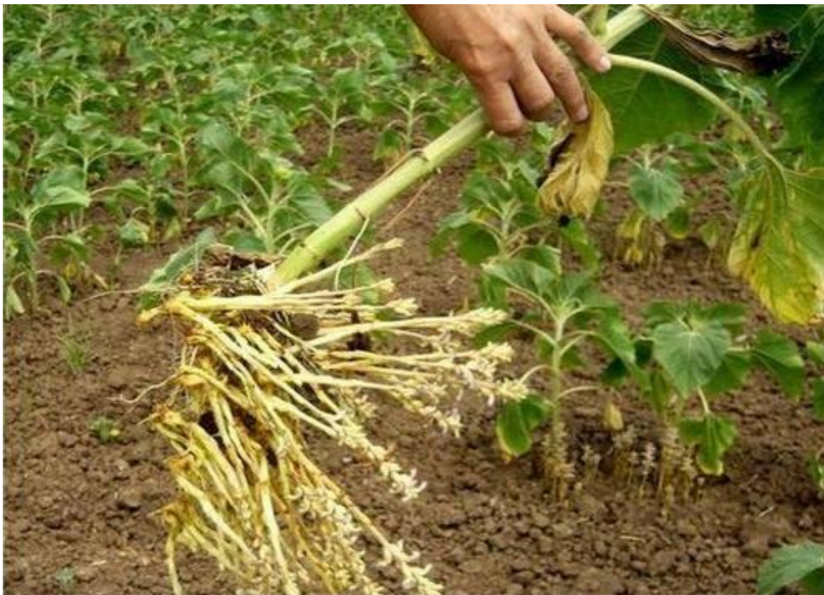
Fig. 3. Root of sunflower which are affected by Orobanche cumana .