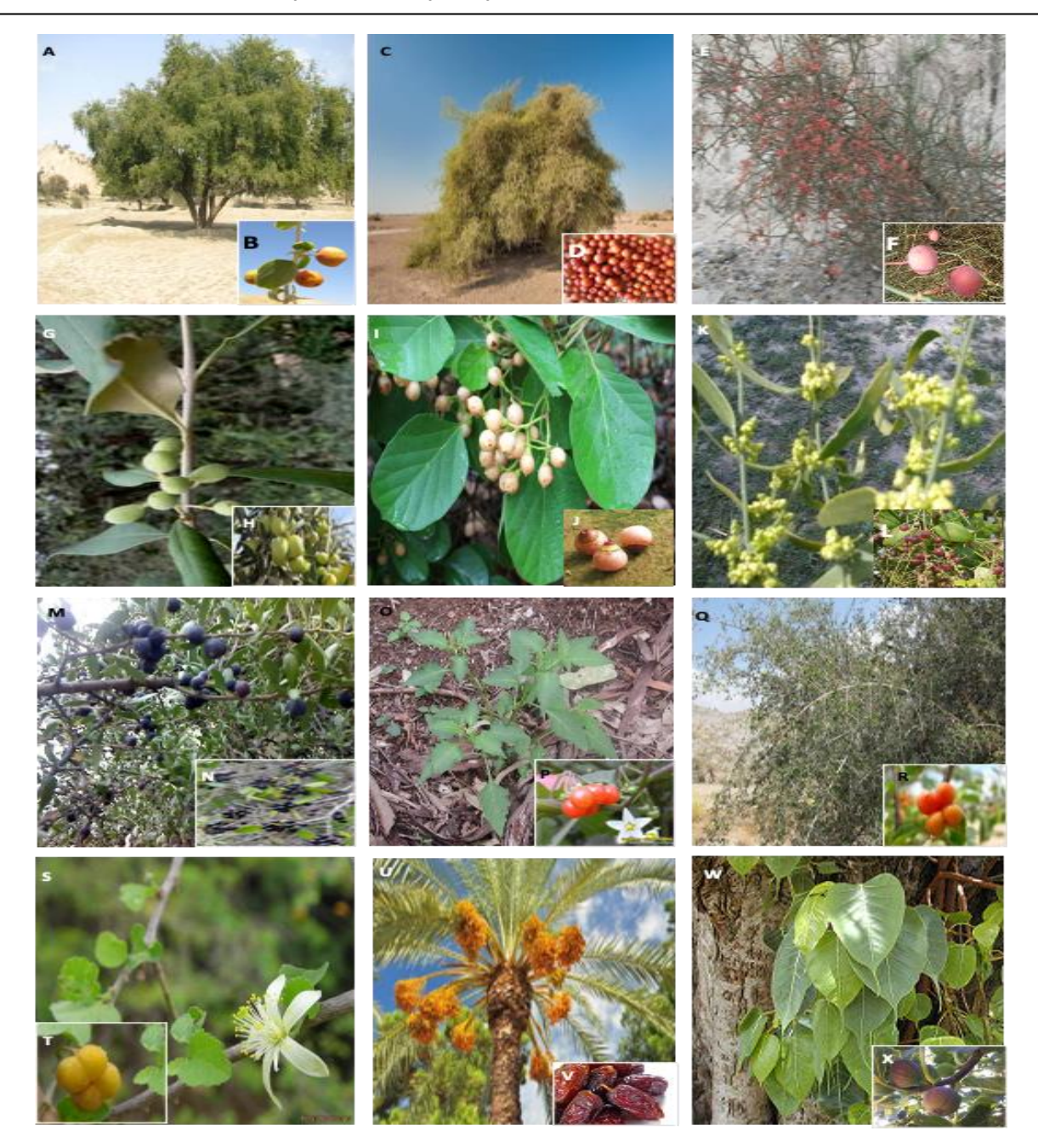
Fig. 2. Photographs of the plants with their respective edible fruits: A) Zizyphus mauritiana, B) fruit, C) Zizyphus numularia, D) fruit, E) Capparis decidua, F) fruit, G) Olea ferruginae, H) fruit, I) Cordia myxa, J) fruit, K) Salvadora oleoides, L) fruit, M) Monotheca buxifolia, N) fruit, O) Solanum nigrum, P) fruit, Q) Grewia tenax, R and T) fruit, S) flower, U) Phoenix sylvesyris V) fruit, W) Ficus religiosa and X) fruit.