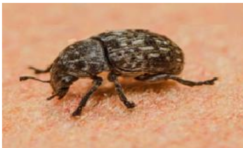
Fig. 1. Imago of Anhtribus nebulosus

Its phenology is closely related to the life cycle of host insects – spruce bud scales. Adult beetles overwinter in protected parts of trees, or in the empty skins of spruce bud scales females. In spring, in the middle of April, beetles that have overwintered appear and additionally nourish by all stages of development of spruce bud scales (larvae, males, females) and sweet secretions of females – honey dew. Eggs are laid from early May to early June under the female's body. The larvae feed on the eggs of spruce bud scales during June – July, pupate in the female's body. Adult beetles of the new generation go to wintering in August (Fig. 1). Thus, one generation is given during the year.