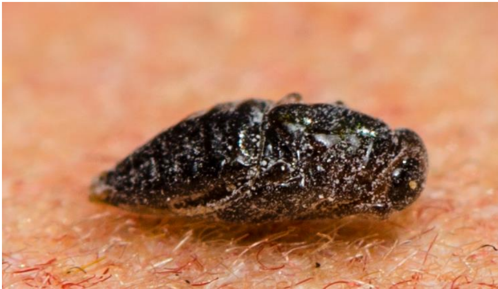
Fig. 6. Pupa of Microterys lunatus