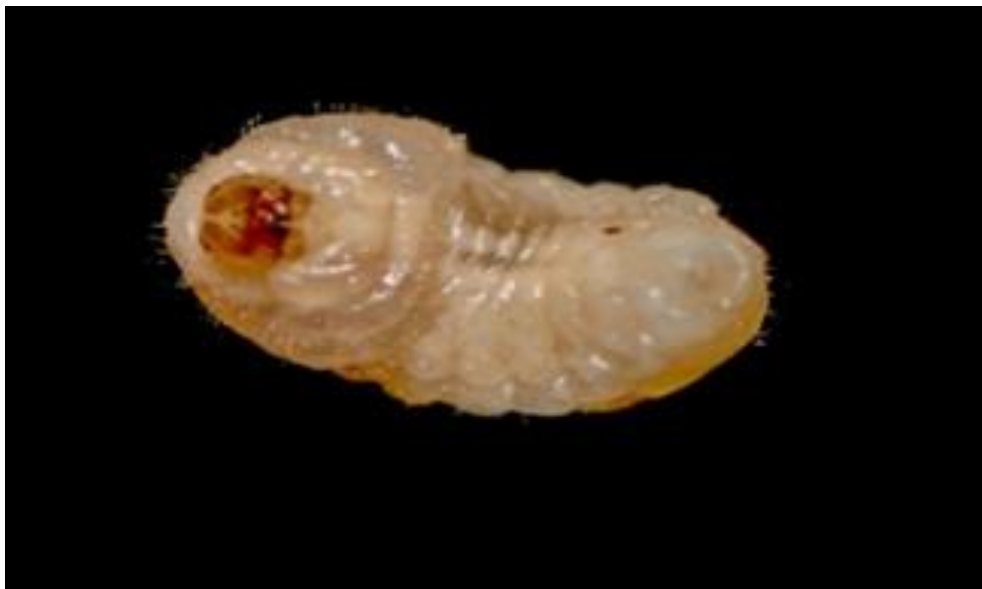
Fig. 2. Larva of Antribus nebulosus

In most cases, one larva of Antribus nebulosus beetle developed in the body of females of the large spruce bud scales, in some cases 2-3 beetle larvae were found. In the case of two or more larvae development, the size of the beetles was smaller (1.5-2 times). In the small spruce bud scales, one larva of Antribus nebulosus always developed (Fig. 2-3).