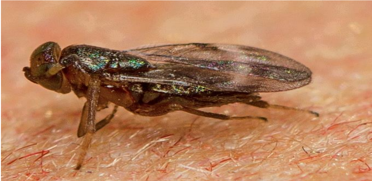
Fig. 4. Imago of Microterys lunatus

Species of the genus Microterys are part of the parasitoids of soft scales, including spruce bud scales. Most of the species of this genus are endoparasites, a small number of species are predators on laid eggs (Fig. 5).