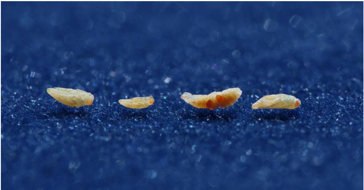
Fig. 5. Larvae of Microterys lunatus

Species of the genus Microterys are part of the parasitoids of soft scales, including spruce bud scales. Most of the species of this genus are endoparasites, a small number of species are predators on laid eggs (Fig. 5).