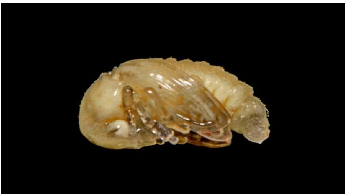
Fig. 3. Pupa of Antribus nebulosus

Species of the genus Microterys are part of the taxonomic core of parasite complexes of soft scales of Coccidea family. Currently, 26 species of this genus are known in the Palearctic to neutralize soft scales, 18 of them are endoparasites, eight are predators on laid eggs (Sugoniaev, 1984; Triapitsyn, 1989). Despite the important role that species of the genus Microterys play in most ecosystems of the globe, including as agents of biological suppression of harmful species, information on their biology is very limited.