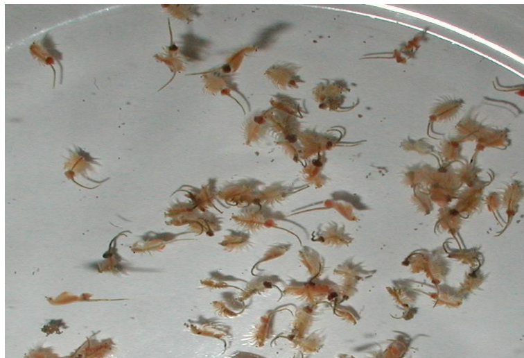
Fig.1. Brine shrimps ( Artemia salina ) from the Kuialnik estuary.

The colonies of Thiobacillus ferrooxidans showed in the Fig.2. Although Thiobacillus ferrooxidans is classified as an aerobic organism, requiring oxygen to grow and survive, it can multiply under anaerobic conditions as well. Anaerobic oxidation has been demonstrated using elemental sulfur with ferric sulfate. However, elemental sulfur or ferric iron must be present in order for the bacterium to grow.