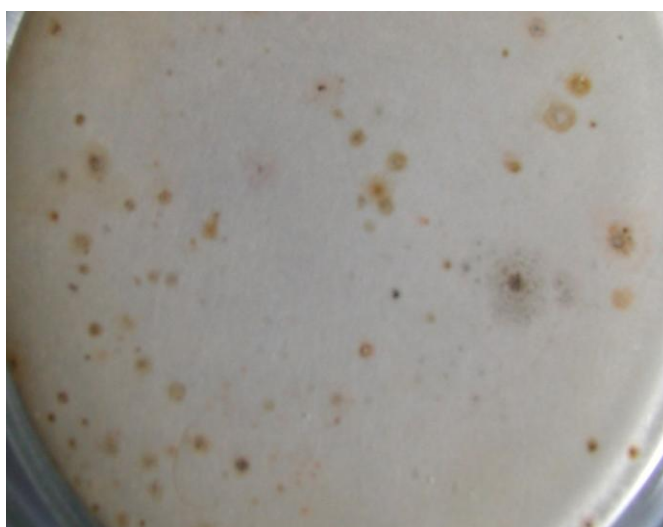
Fig. 4. Mycobacterium growth on the filter paper (yellow and brown colonies).

The vegetative cells of all mycobacterium are aerobic, Gram-negative, elongated rods with either rounded or tapered ends. They glide in water films across solid surfaces, secreting slime (polysaccharide) tracks in which many cells migrate to produce feathery extensions at the colony margin (Bayraktar, 2011b). At the onset of nutrient depletion the cells migrate back along the slime tracks, aggregating by chemotaxis, to form large concentrations of cells. These aggregates then develop into fruiting bodies which are raised above the agar surface and typically develop a bright yellow, red or brown pigmentation – see Fig.4.