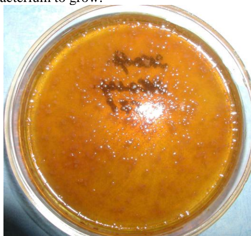
Fig.2. The colonies of Thiobacillus ferrooxidans growth in selective medium.

The colonies of Thiobacillus ferrooxidans showed in the Fig.2. Although Thiobacillus ferrooxidans is classified as an aerobic organism, requiring oxygen to grow and survive, it can multiply under anaerobic conditions as well. Anaerobic oxidation has been demonstrated using elemental sulfur with ferric sulfate. However, elemental sulfur or ferric iron must be present in order for the bacterium to grow.