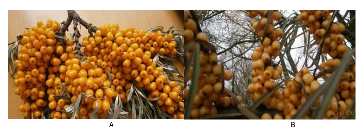
Figure 2. Varieties of Sea buckthorn "Oliana" (A), "Adaptyvna" (B) (authors: V.S. Frantsishko, T.Z. Moskalets, V.V. Moskalets, I.V. Grynyk ).

Growing demand for Buckthorn the country can cover only the opening of new processing plants. According to experts, a significant surge of interest is noticeable in countries such as: Japan, South Korea and Singapore. Today, the market for this culture estimated at $ 1 billion (FAOSTAT ..., 2015; 2018). Market of processing products Sea buckthorn is estimated at $ 17 billion. Together with the the notable increasing demand the offer for this culture is still low.