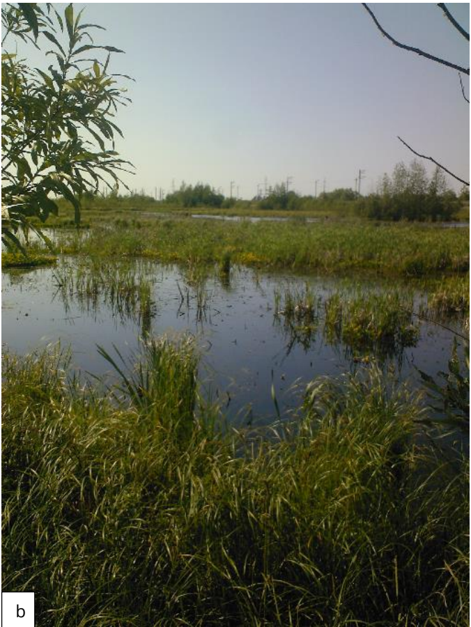
Figure 1. The biotopes: a. Lowland swamp near the village Saygatina; b. Floodplain meadow on the outskirts of the village Saigatina; c. Channel of the river Ob in the env. of the village Saygatina. Photo of V.V. Duhin

The results of collecting larvae are presented in Table 1.