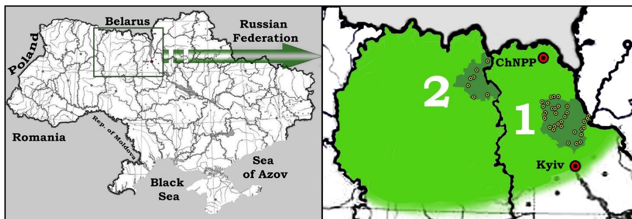
Fig. 1. The studied regions of the zone of Ukrainian Polissia: 1 - Kyiv Polissia (SS1), 2 - Zhytomyr Polissia (SS2)

The results of WBC-measurements of rural residents of Vyshhorod district (Kyiv Polissia, study site 1, SS1) and Narodytskyi district (Zhytomyr Polissia, study site 2, SS2), Kyiv and Zhytomyr oblasts, respectively (Fig. 1) have been analyzed. These districts were chosen because of their somewhat representative nature for the Ukrainian Polissia countryside, which allows one to consider as many characteristics of the region as possible. SS1 is characterized by a predominance of sod-podzolic soils, a relatively low density of ^{137}\text{Cs} surface contamination (48.88 kBq/m 2 ), relatively large rural settlements (the average population in the village – 1575), and less, compared to SS2, the availability of forest food (average distance to the nearest forest – 13.35 and 1.89 km, respectively). Meanwhile, SS2 is characterized by high ^{137}\text{Cs} contamination (230.33 kBq/m 2 ), small settlements (the average village population – 778), availability of food of forest origin (distance to the nearest forest – 1.89 km), and meadow soils.